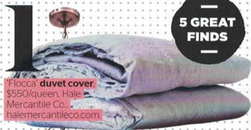
1 Flocca duvet cover, $550/queen, Hale Mercantile Co., halemercantileco.com