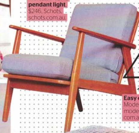
4 Easy chair, $1250, Modern Times, moderntimes.com.au