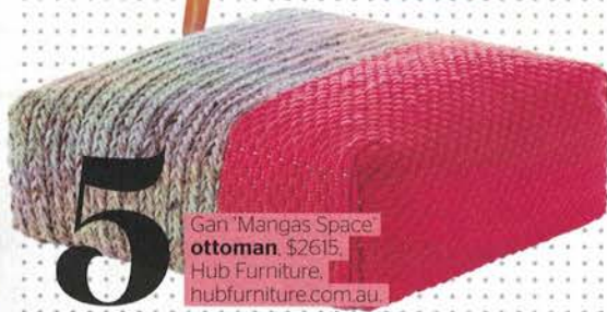
5 Gan 'Mangas Space' ottoman, $2615, Hub Furniture, hubfurniture.com.au