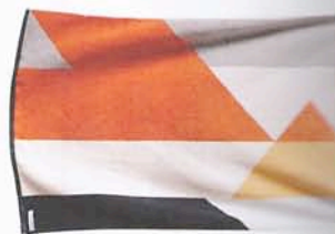
'Spice' bath towel, $79.95/each, Sunday Mixx Stockists, page 220

and tassels can add an exotic feel to these everyday items, and thick-pile floor mats are perfect to sink your toes into. Another option is sophisticated, slimline-Turkish hammam towels. "They're incredibly fast drying, can double as a beach towel and their flat-woven design means they take up less space on shelves and in the washing machine," says Verity Kizek of Atolyia. >