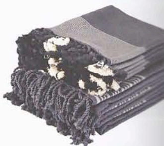
'Truva' hand towels in Charcoal, $29/each, and towels, $59/each, Atolyia.