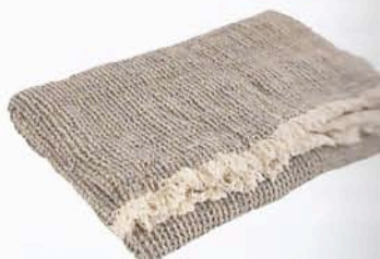
'Flocca' linen bath towel in Tempest Waffle, $155/each, Hale Mercantile Co.