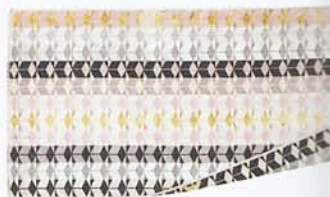
'Fidelis' bath towel, $99/each, Ziporah Lifestyle.