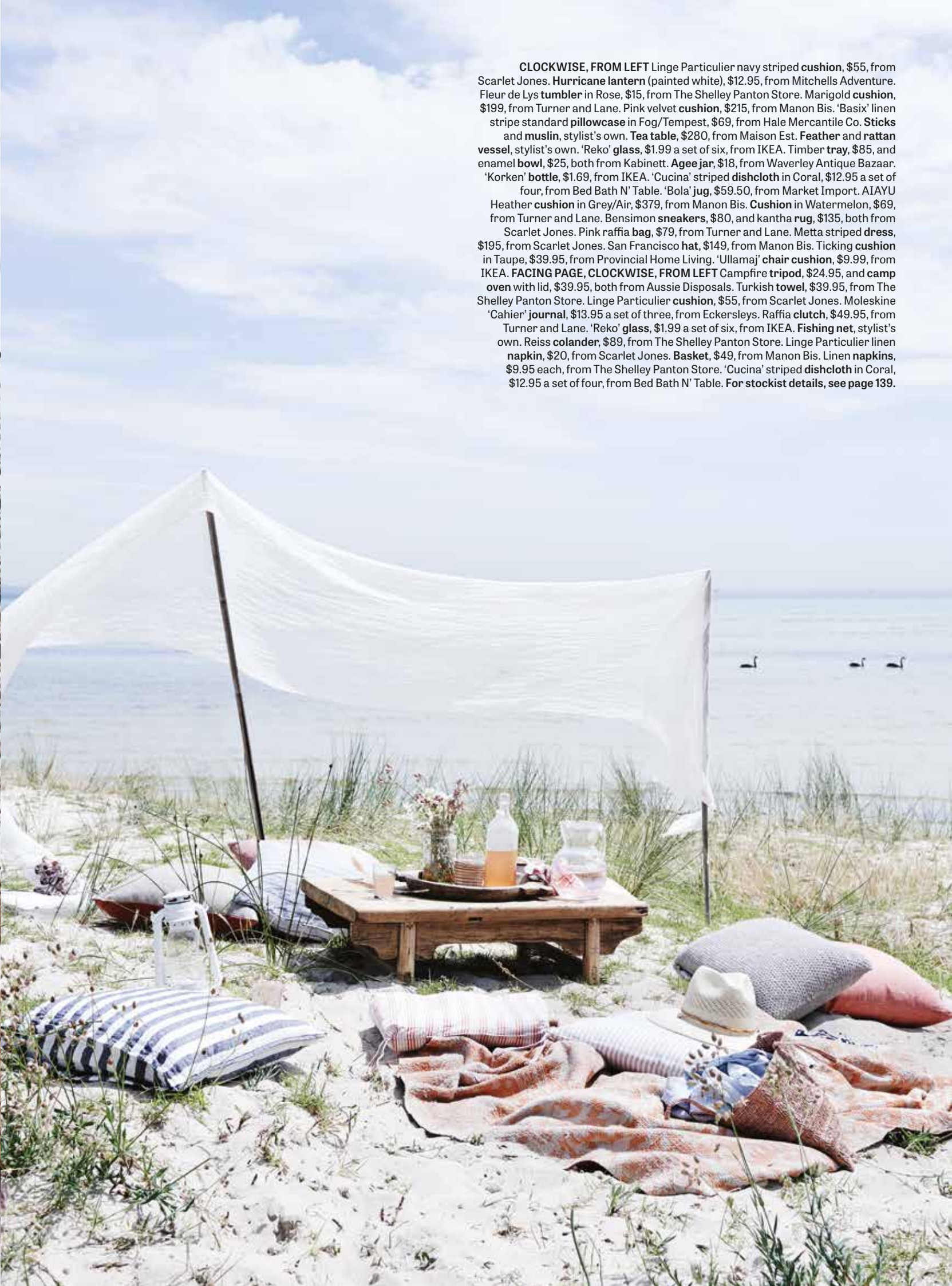
CLOCKWISE, FROM LEFT Linge Particulier navy striped cushion, $55, from Scarlet Jones. Hurricane lantern (painted white), $12.95, from Mitchells Adventure. Fleur de Lys tumbler in Rose, $15, from The Shelley Panton Store. Marigold cushion, $199, from Turner and Lane. Pink velvet cushion, $215, from Manon Bis. 'Basix' linen stripe standard pillowcase in Fog/Tempest, $69, from Hale Mercantile Co. Sticks and muslin, stylist's own. Tea table, $280, from Maison Est. Feather and rattan vessel, stylist's own. 'Reko' glass, $1.99 a set of six, from IKEA. Timber tray, $85, and enamel bowl, $25, both from Kabinett. Agee jar, $18, from Waverley Antique Bazaar. 'Korken' bottle, $1.69, from IKEA. 'Cucina' striped dishcloth in Coral, $12.95 a set of four, from Bed Bath N' Table. 'Bola' jug, $59.50, from Market Import. AIAYU Heather cushion in Grey/Air, $379, from Manon Bis. Cushion in Watermelon, $69, from Turner and Lane. Bensimon sneakers, $80, and kantha rug, $135, both from Scarlet Jones. Pink raffia bag, $79, from Turner and Lane. Metta striped dress, $195, from Scarlet Jones. San Francisco hat, $149, from Manon Bis. Ticking cushion in Taupe, $39.95, from Provincial Home Living. 'Ullamaj' chair cushion, $9.99, from IKEA. FACING PAGE, CLOCKWISE, FROM LEFT Campfire tripod, $24.95, and camp oven with lid, $39.95, both from Aussie Disposals. Turkish towel, $39.95, from The Shelley Panton Store. Linge Particulier cushion, $55, from Scarlet Jones. Moleskine 'Cahier' journal, $13.95 a set of three, from Eckersleys. Raffia clutch, $49.95, from Turner and Lane. 'Reko' glass, $1.99 a set of six, from IKEA. Fishing net, stylist's own. Reiss colander, $89, from The Shelley Panton Store. Linge Particulier linen napkin, $20, from Scarlet Jones. Basket, $49, from Manon Bis. Linen napkins, $9.95 each, from The Shelley Panton Store. 'Cucina' striped dishcloth in Coral, $12.95 a set of four, from Bed Bath N' Table. For stockist details, see page 139.